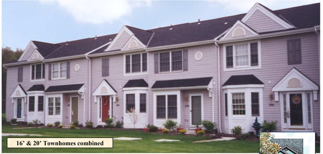
16' & 20' Townhomes combined