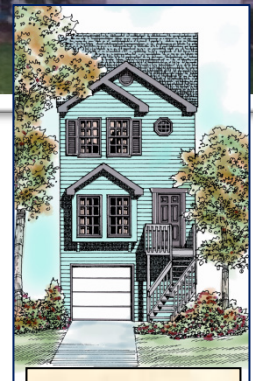
16' Townhome (Front garage)