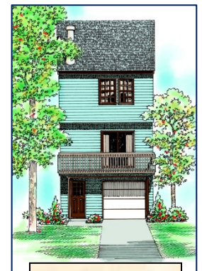
16' Townhome (Rear garage)

Photos or renderings will vary from actual plan.