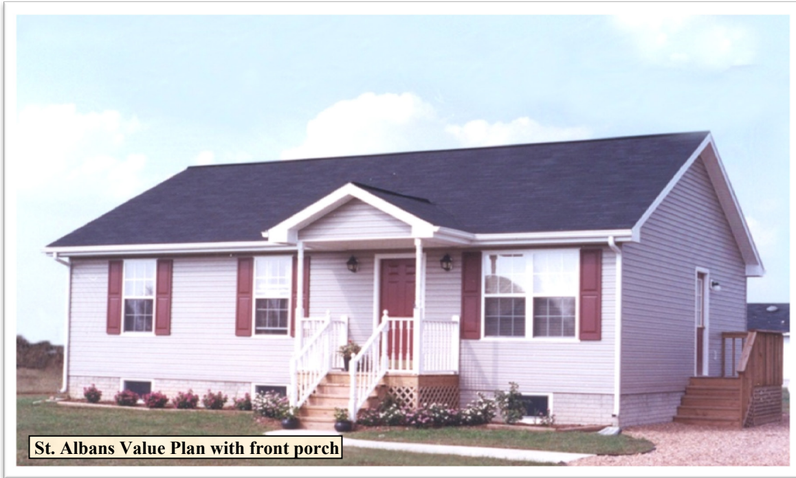
St. Albans Value Plan with front porch